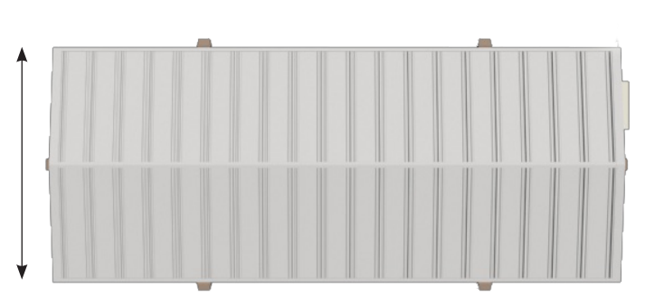
Top View (1/65)