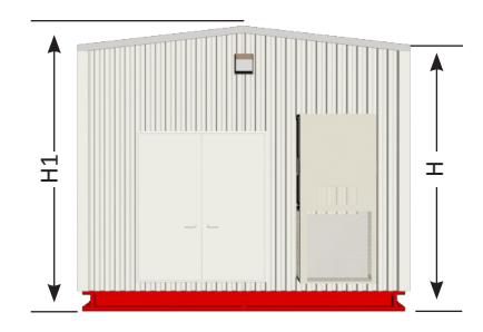
Side View (1/65)